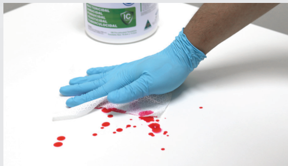
B: Wiping from clean to dirty in an S-shaped pattern, ensuring not to go over the same area twice