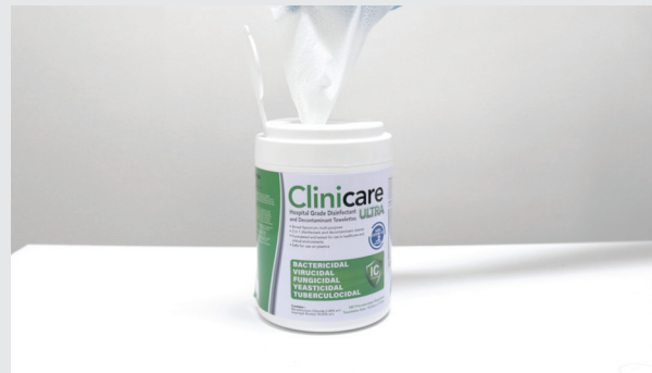
A. Dispense another Clinicare towelette