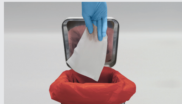
C. Dispose of used towelette