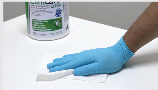
B: Wiping the decontaminated area from top to bottom in an S-shaped pattern, ensuring not to go over the same area twice.