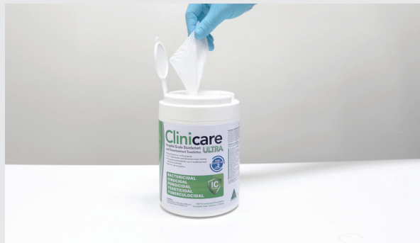
A. Dispense Clinicare towelette